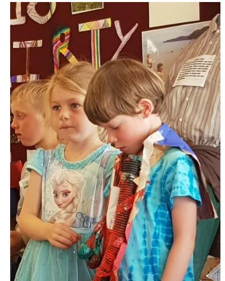
Last Assembly focussing on The Human Body