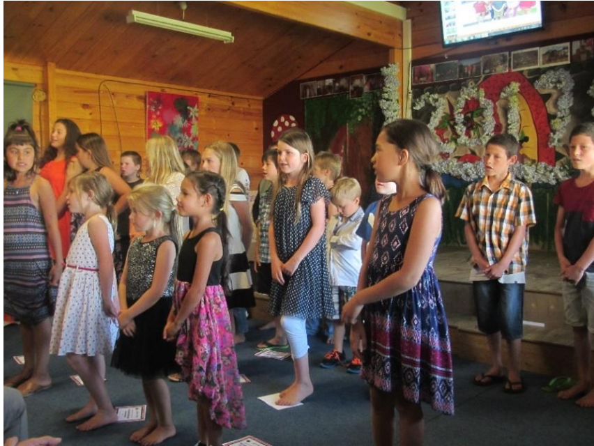
Last year's final assembly.

If children could be here by 5.45pm for a prompt 6PM start. Can students be smartly dressed please. Last year parents brought a plate for after the assembly and due to it's success we will again be doing this.